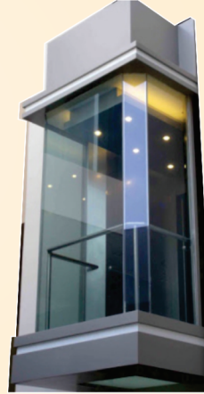
Glass Capsule Cabin