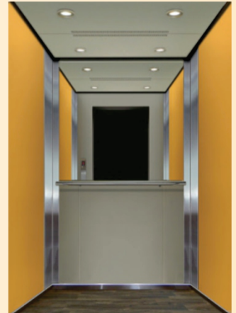
Stainless Steel Cabin