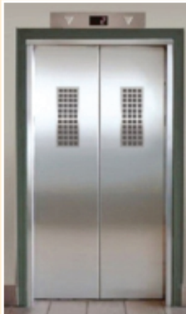
Auto Center Small Vision Door