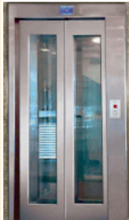
Glass Big Vision Door